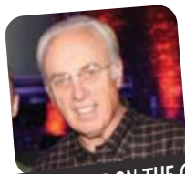
CONFÉRENCE ON THE GOSPEL ...

- We are honoured that John MacArthur has agreed to be the main speaker at a conference on the gospel we are planning for November 2011, with other guest-speakers.