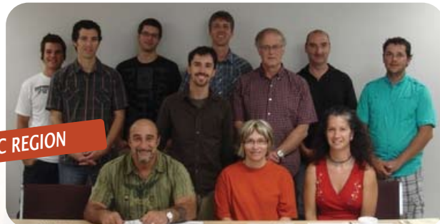
NEW QUEBEC REGION